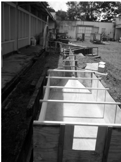
Fig 1 Experimental set-up

In order to investigate the effect of entrance zone angle on the trapping efficiency of the desilting tank, a series of tests were carried out changing the entrance expanding angle of the desilting tank while keeping the length of the tank constant (Fig 1). Details of the tests carried out for five different expanding angles for each of the three steady discharges of 15 l/s, 20 l/s and 25 l/s are given in Table 1. Experiments (Ratnayake and Dissanayake, 2005) have shown that the high tapping efficiency is obtained at expanding angles below 30 degrees. Therefore, expanding angles of 7°, 10°, 20°, 30° and 90° deg have been selected in this experiment. In each test, 1 kg of dry quartz sand in the size range of 90-125 \mu\text{m} were fed at the upstream and the dry weights of the sand trapped were measured.