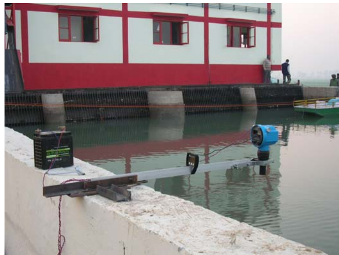
Figure 3: Ultrasonic level sensor installed on left side abutment of headrace channel for free water level measurement

The methods recommended for free water level measurements in the Standard are bubbler with compressed air, immersible pressure gauges and ultrasonic level sensors. The IITR Team deployed high-precision immersible pressure transducers with either local or remote digital display (as per the requirement) in the few situations where the channel bed was not covered by silt and proper measuring well had already been constructed as laid down in the above Standard. In other cases of free-water level measurement in open channels, a digital ultrasonic level sensor was installed at either abutment (see figure 3). For this purpose, location with minimum surface turbulence is selected. Average of the levels measured by the two sensors installed on opposite abutments is used in head calculation.