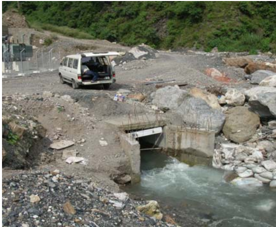
(a) Uncalibrated weir temporarily installed in tail race channel