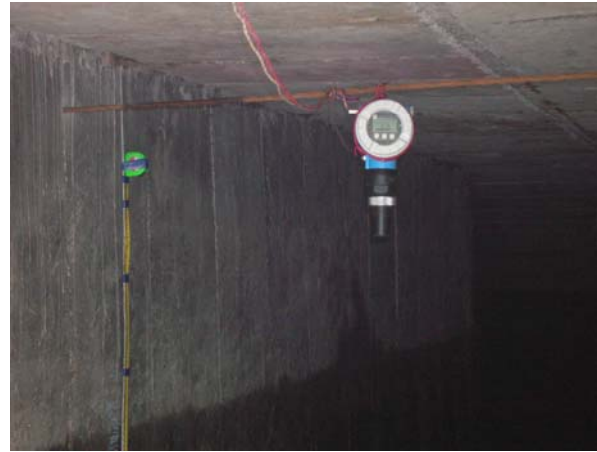
(b) Ultrasonic level sensor with remote digital display installed for measurement of head over the weir