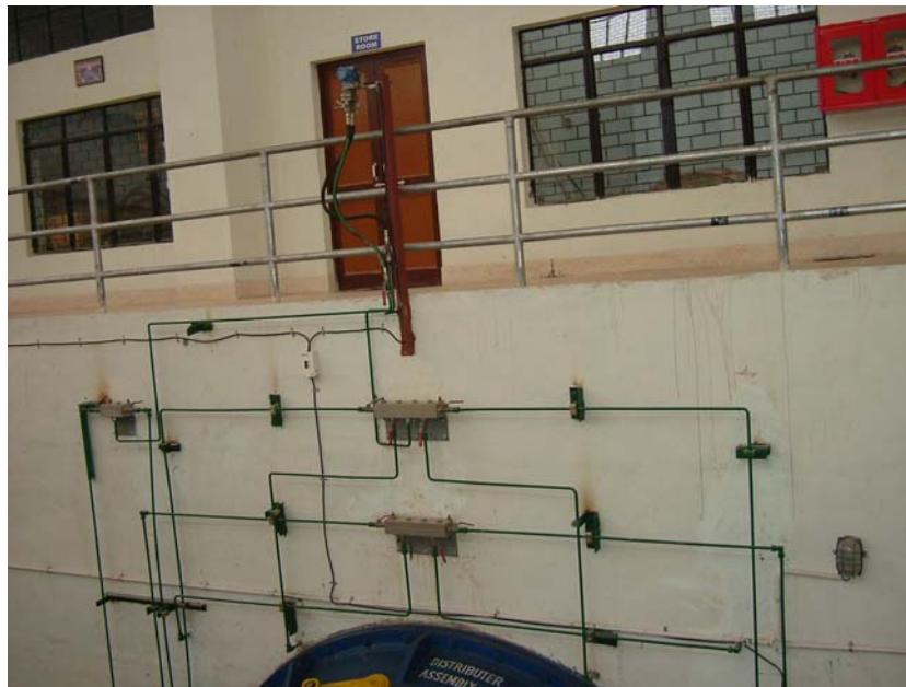
Figure 4: Differential pressure transducer installed for relative discharge measurement for the index test