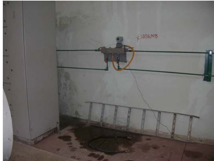
Figure 2: Digital pressure transducer installed for head measurement at draft tube

The methods recommended for free water level measurements in the Standard are bubbler with compressed air, immersible pressure gauges and ultrasonic level sensors. The IITR Team deployed high-precision immersible pressure transducers with either local or remote digital display (as per the requirement) in the few situations where the channel bed was not covered by silt and proper measuring well had already been constructed as laid down in the above Standard. In other cases of free-water level measurement in open channels, a digital ultrasonic level sensor was installed at either abutment (see figure 3). For this purpose, location with minimum surface turbulence is selected. Average of the levels measured by the two sensors installed on opposite abutments is used in head calculation.